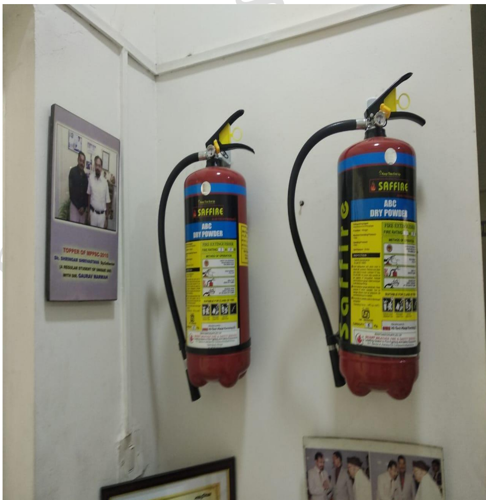
FIRE EXTINGUISHERS 'ISI Marked' 1 & 2

4. FIRE EXTINGUISHERS 'ISI Marked': There are three High-tech FIRE EXTINGUISHERS 'ISI Marked' of ABC type with a capacity of 6kg each.