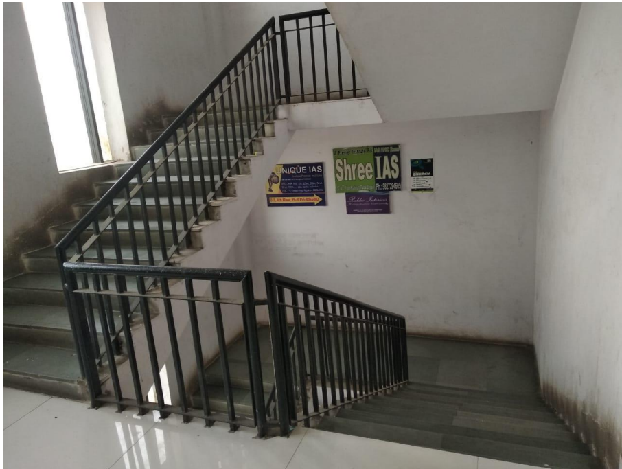
FIRE SAFETY EXITS BROAD STAIRCASES

3. FIRE SAFETY EXITS: In case of fire there are Broad Staircases for convenient exit.