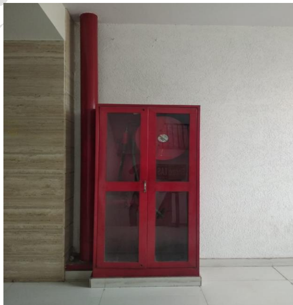
FIRE SAFETY NETWORK