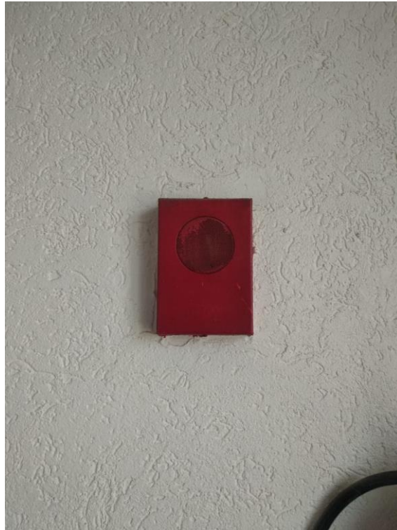
FIRE SAFETY ALARM