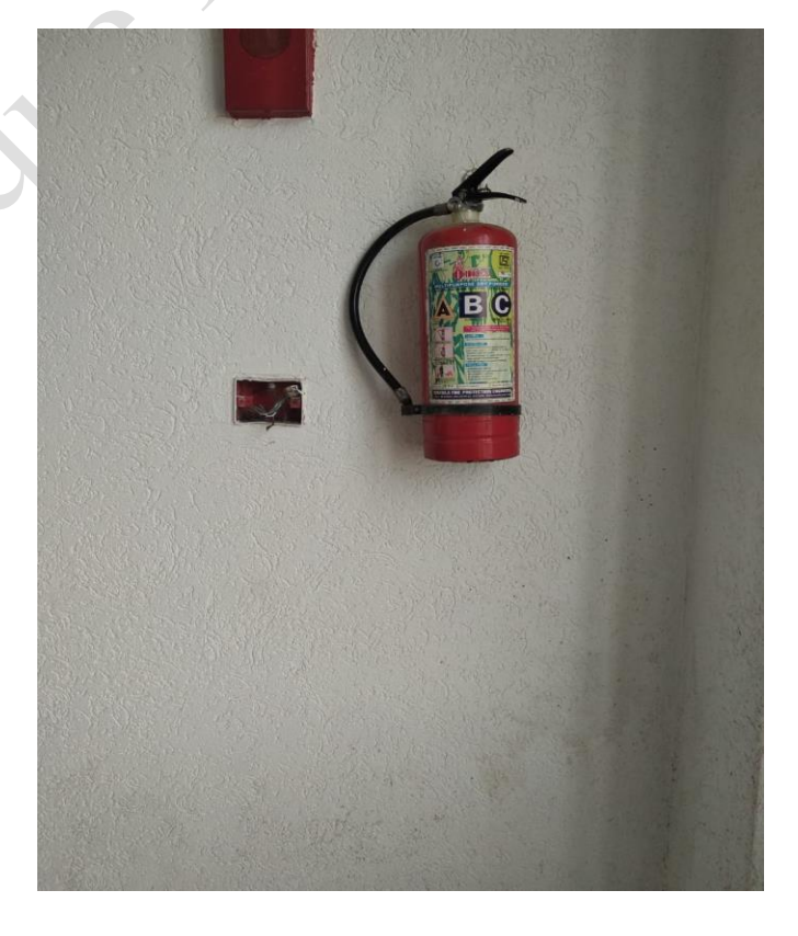
FIRE EXTINGUISHERS 'ISI Marked'

There is 4th FIRE ENTINGUISHER 'ISI Marked' of ABC type with a capacity of 5kg outside the Unique IAS Premises, Near the Broad Staircases and Fire Alarm