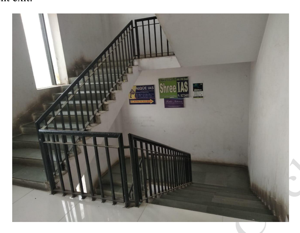
FIRE SAFETY EXITS BROAD STAIRCASES

3. FIRE SAFETY EXITS: In case of fire there are Broad Staircases for convenient exit.