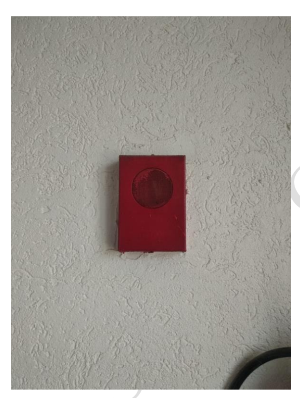
FIRE SAFETY ALARM

1. FIRE SAFETY ALARM : There are FIRE SAFETY ALARMS in the premises of Platinum plaza, (Which is provided by M.P Housing Board), Where Unique IAS is situated.