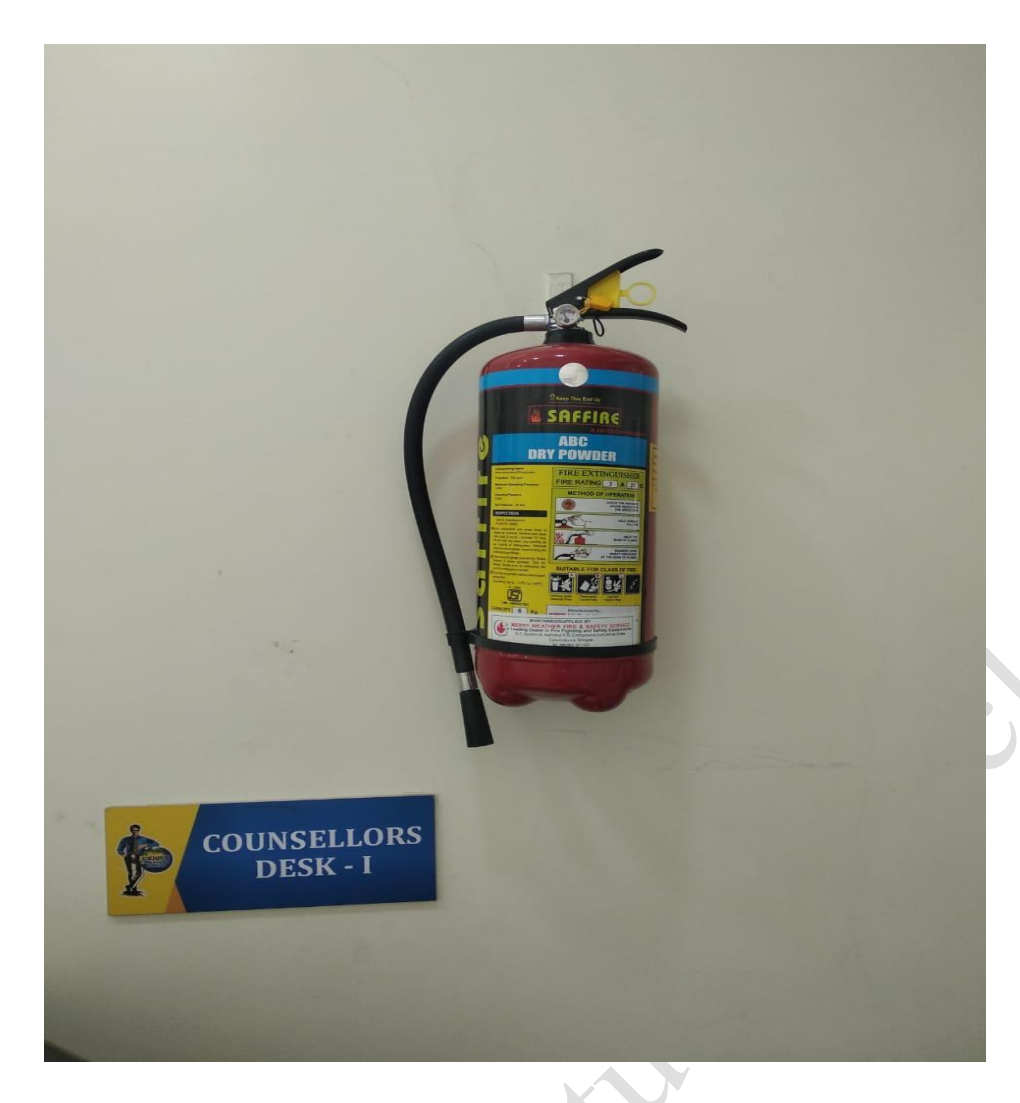
FIRE EXTINGUISHERS 'ISI Marked' 3

There is 4th FIRE ENTINGUISHER 'ISI Marked' of ABC type with a capacity of 5kg outside the Unique IAS Premises, Near the Broad Staircases and Fire Alarm