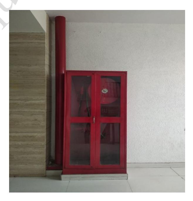
FIRE SAFETY NETWORK

2. FIRE SAFETY NETWORK : There are FIRE SAFETY NETWORKS in the premises of Platinum plaza, (Which is provided by M.P Housing Board), Where Unique IAS is situated.